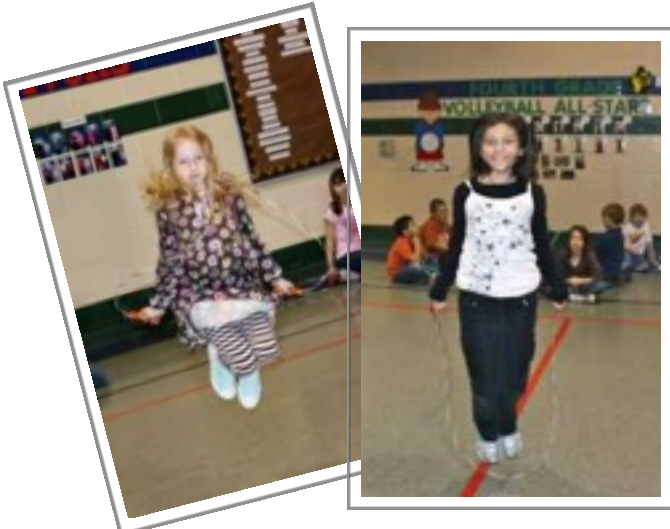
Jump Rope for Heart participants February 2009

Each class will have a PTA-sponsored Valentine's Day Party on Friday, February 12, 2010 beginning at 2:00. We hope to see you there!